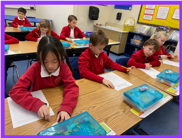
Writing about our Christmas Break.