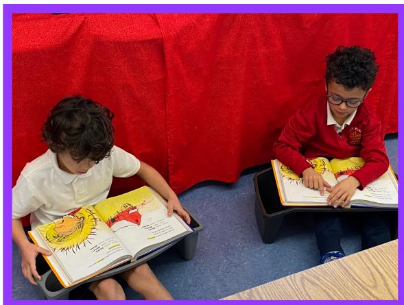
Reading our anchor text 'Click, Clack, Moo, Cows that Type.'